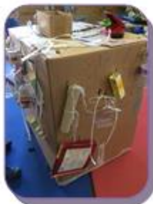
Mark making without scissors or glue.

The Early Years Foundation Stage (EYFS) is a document for early years providers, to help them support your children's learning and development from birth to five years old. (Revised EYFS April 2017)