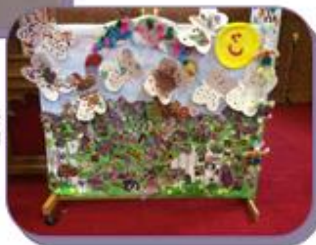
Display made for our Grandparents Festival