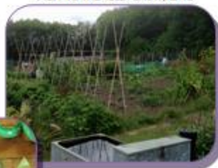
Visit to the local allotments