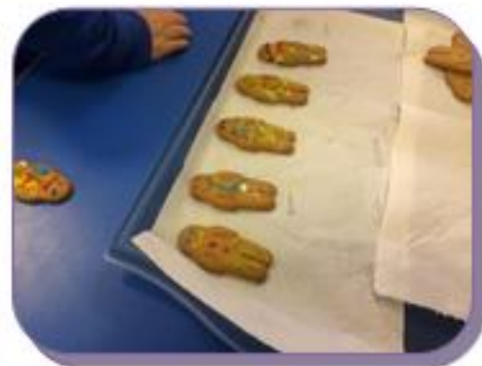
Decorating gingerbread men