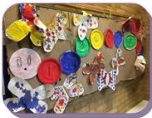
The Hungry Caterpillar

All registered early years providers are inspected by Ofsted to make sure they meet the legal requirements of the EYFS. The supporting children team offer support and information to early years providers too.