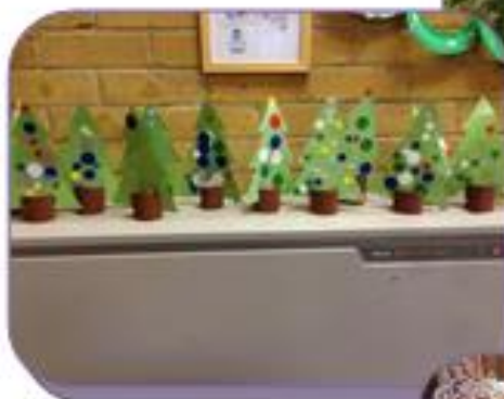
Christmas decorations the children made