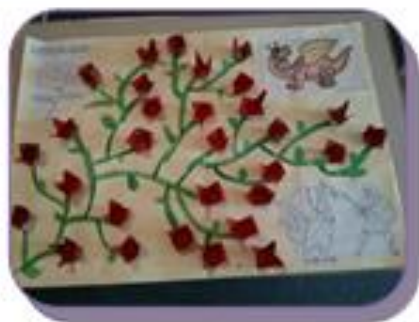
St George's Day picture

Some 3/4 year olds are entitled to '30 hours' please visit www.childcarechoices.gov.uk